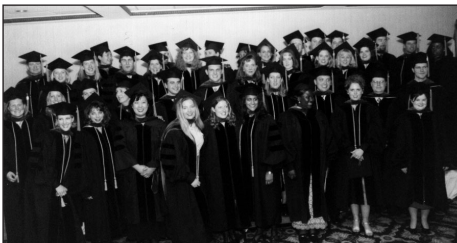
Introducing the University of Missouri-St. Louis School of Optometry class of 1999. Congratulations!

A publication for alumni and friends of the University of Missouri-St. Louis School of Optometry