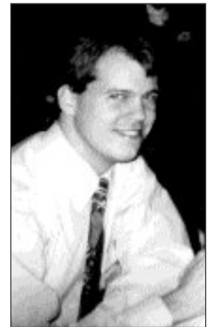
(More photos on page 7)